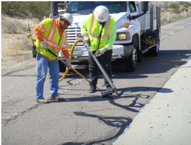
Sealzall, Manual Sealing Interstate 8 – Winterhaven, CA

Caltrans D11 Maintenance takes a proactive approach to avoid the need for expensive heavy crack cleaning. D11 participates in a program to seal new shoulder joints and keep these joints sealed to prevent the build-up of heavy debris and extend the lifespan of the shoulder.