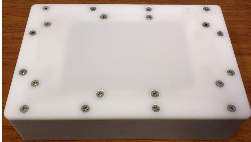
Figure 3.2: Heated enclosure ver. 1.2. AHMCT added mechanical fasteners to prevent delamination in the event of adhesive failure between the aluminum enclosure and the Delrin fascia