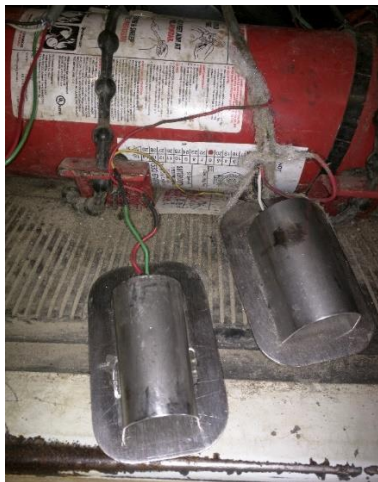
Figure 2.2: The 0506 seat vibration motors