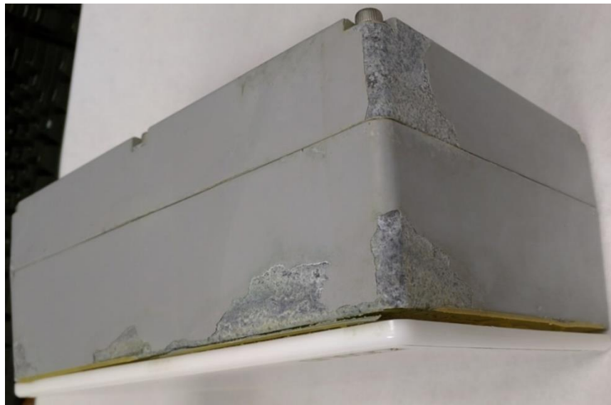
Figure 3.1: Heated enclosure ver. 1.1. Adhesive failure causing delamination between the aluminum enclosure and the Delrin fascia

delamination of the front fascia of the heated enclosure ver. 1.0 from interfering with the heated wiper operation. The radar enclosure icing mitigation system ver. 1.5 was installed on both the 0024 and 0506 snowplows on 04/05/2016. Previous test results show that the heated enclosure ver. 1.2 will eventually fail due to delamination since the design did not change from that of the previous enclosure which did delaminate. Any new radar enclosure icing mitigation system should be designed so that it does not have any epoxy joints or metal that can corrode. The solution to this problem is to design away from any adhesive joint and non-anodized aluminum. AutonomouStuff currently provides sealed (non-heated) enclosures for ESRs used in the mining industry. Their new sealed enclosures for the mining industry use rubber gasket and mechanical fasteners to secure the front fascia onto the aluminum housing. The snowplow DAS does not require the factory-sealed ESR to be housed inside any sealed enclosure since the ESR is already sealed. The AutonomouStuff heated enclosure happens to be sealed.