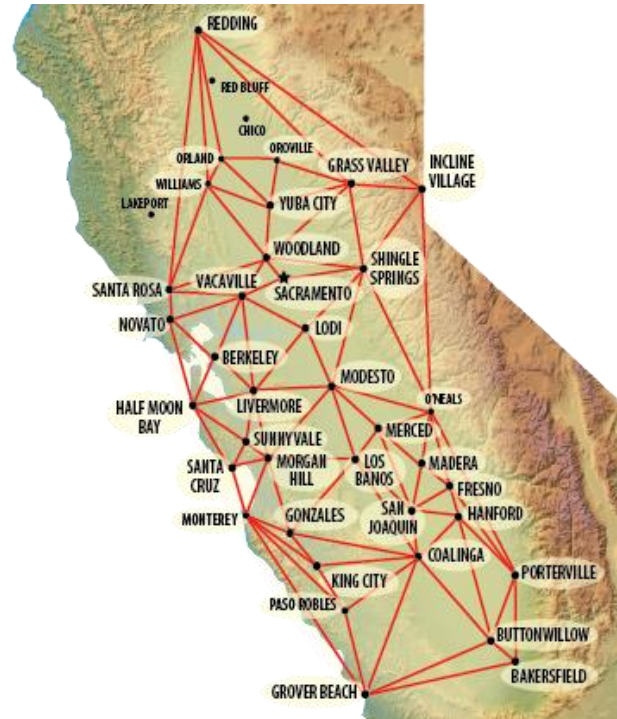
Figure 4.1: CSDS RTN 2014 coverage