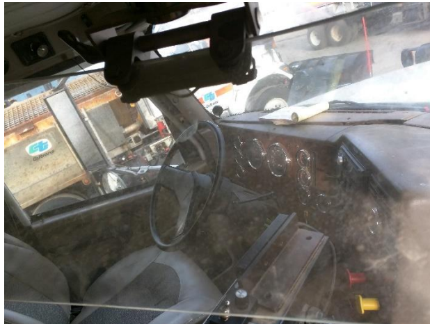
Figure 2.1: The 0024 snowplow combiner before cleaning