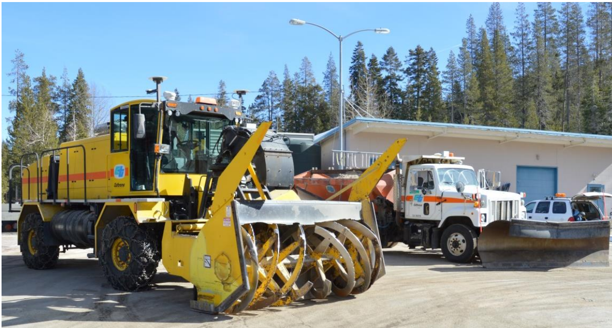
Figure 1.1: Snowplow Driver Assistance System installed on Caltrans snow blower (yellow) and snowplow (white)

Snow removal operations during a whiteout snowstorm are one of the most difficult tasks that winter maintenance personnel face. Researchers at the University of Minnesota and the Advanced Highway Maintenance and Construction Technology (AHMCT) Research Center, along with our research partners at the California Department of Transportation (DOT) (Caltrans), have long considered the benefits of providing driver guidance information to enhance winter maintenance activities. The University of Minnesota developed an innovative driver assistance system (DAS) for snowplows using the Global Positioning System (GPS), an automotive radio detection and ranging (radar or RADAR) system, a novel Head-Up Display (HUD), and a haptic feedback seat system using vibrating motors. They have installed and successfully tested systems on snowplows in Minnesota and Alaska. MTS, a Minnesota company, licensed the DAS from the University of Minnesota and has installed the DAS snowplow driver assistance system on two snowplows and one snow blower based at the Caltrans Kingvale maintenance facility next to Interstate 80 (I-80) (see Figure 1.1).